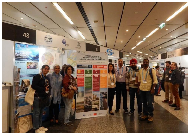
Fig. 7 – IGCP-637 participants at the UNESCO IGCP poster by the IUGS booth at EGU 2019.

Leaders of the IGCP-637 project attended the EGU 2019, where a final wrap-up poster was displayed in the poster session and objectives and main conclusions were also presented at the general IGCP Splinter Meeting, organized by Özlem Adiyaman Lopes representing UNESCO. Leaders of other IGCPs also attended this meeting and information of good practices were exchanged. Özlem displayed, at both the meeting and the IUGS booth, a poster with information on several IGCP projects, among which IGCP-637 was promoted.