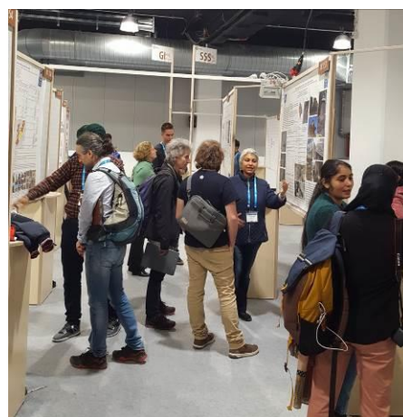
Fig. 4 and 5 - HSS correspondents attending the oral and poster session at EGU 2019.