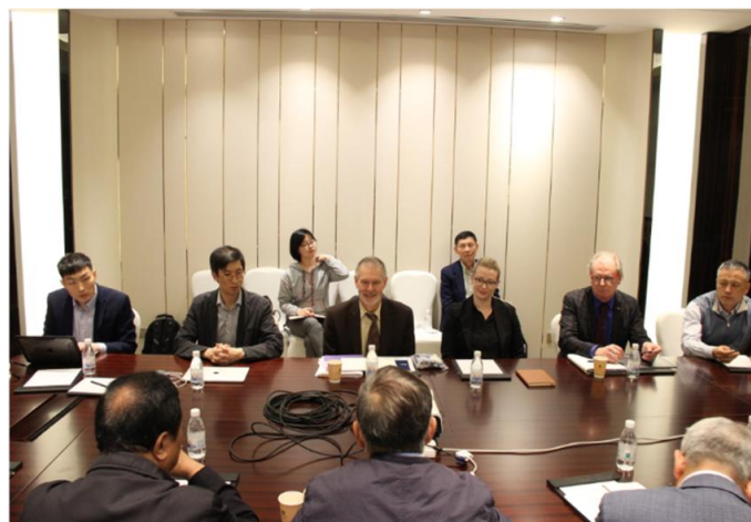
Fig. 1 and 2 – DDE Working Group Workshop.