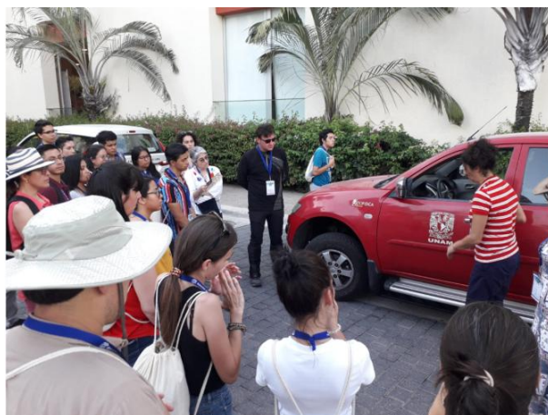
Fig. 12 and 13 - IUGS-IFG training in soil sample recovery from the interior and exterior of a car, Puerto Vallarta, Mexico