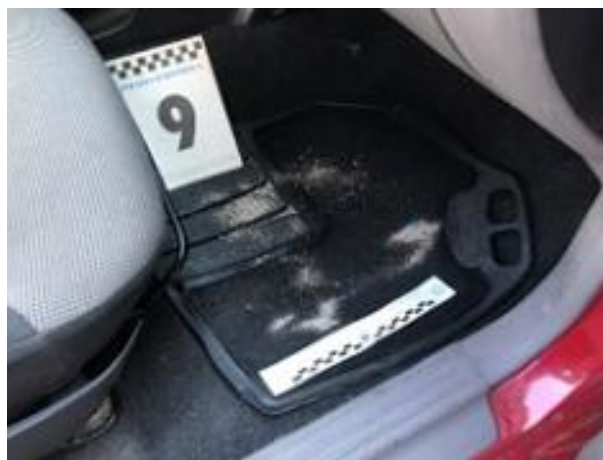
Fig. 14 and 15 - IUGS-IFG training in the geological analysis of soil collected from inside a car, Puerto Vallarta, Mexico