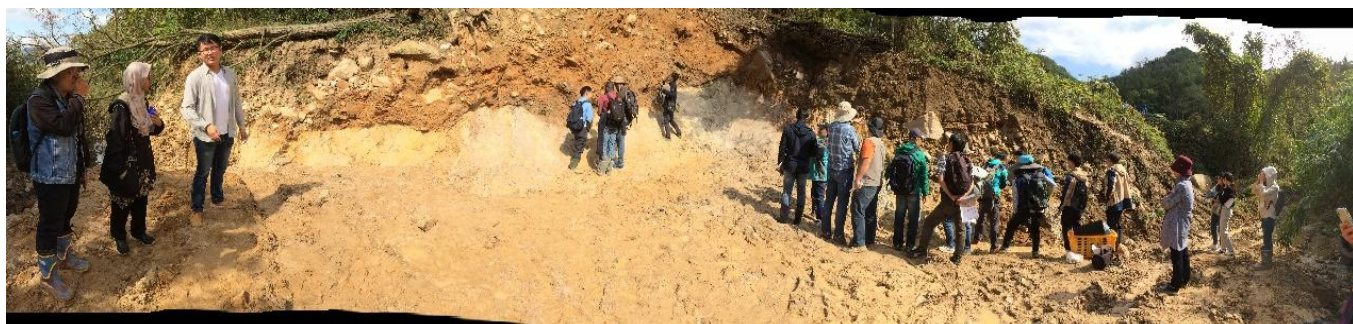
Fig. 16 - Trench site in Gyeongju.

A meeting for Taiwan (China) - Korea - TGG Cooperation was held on 16 th October in Gyeongju. Issues on geohazards guideline and international meetings were discussed at the meeting.