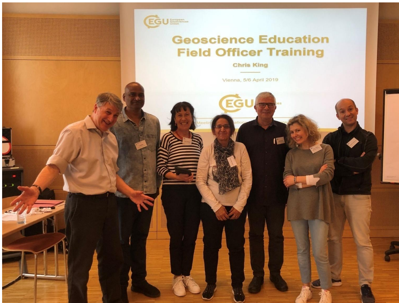
Fig. 5, 6, 7, 8 and 9 - Photographs of the training of the two IUGS/IGEO Field Officers (from India and Morocco) appointed last year, alongside the four European Geosciences Union (EGU) Field Officers trained at the same time.