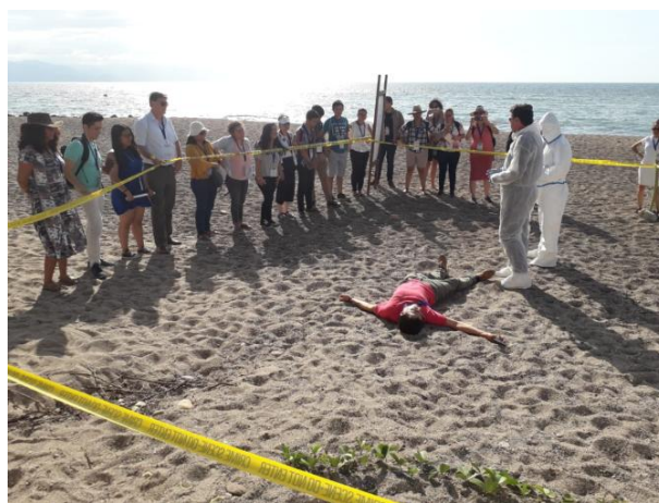
Fig. 10 and 11 - IUGS-IFG training in Forensic Geology (search and crime scene examination), Puerto Vallarta, Mexico