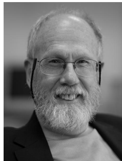
Fig. 3 - Dr Thure Edwards Cerling