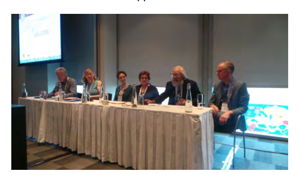
Panelists of the session "What's the Point of Geoethics?"