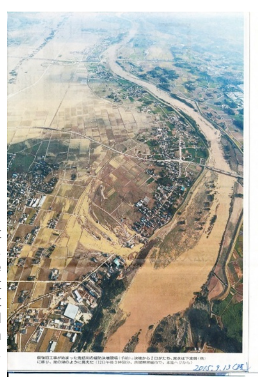
Figure 3: Kinu river flood on Sept. 10, 2015 in the next village to the author's. Note that the river flows from the bottom (north) to the top (south). It overflowed and cut the left bank not at the undercut slope of the meander but in the straight part. Possibly the narrow man-made channel downstream caused higher water levels upstream with consequent overflowing.

intending to avoid flooding, and sought better transportation of goods. The change of the natural drainage system in the 17<sup>th</sup> century led to the large scale flooding in the 21<sup>st</sup> century (Fig. 3). While engineers and scientists know that human actions can lead to mechanisms and processes that cause unusual natural phenomena, but society (government and local committees) do not expect or anticipate such events or that some disasters are partly man made.