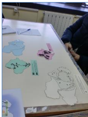
Fig. 3 - Continental jigsaw puzzles.