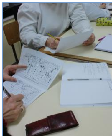
Fig. 4 - Geobattleships.