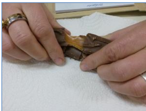
Fig. 1 - Faults in MarsTM bars.

The report on the first year of the IUGS/EGU Field Officer programme has just been released. It showed that the four European Geosciences Union (EGU) Field Officers (France, Italy, Portugal, Spain) and the two IUGS/International Geoscience Education Organisation (IGEO) Field Officers (India, Morocco) had presented 21 workshops in 15 locations with 379 participants. The numerical and written feedback was excellent. Sadly the four new EGU Field Officers (Albania, Germany, Hungary, Turkey) and the three new IUGS/IGEO Field Officers (Chile, Malaysia, Togo) could not be trained in May due to the coronavirus epidemic.