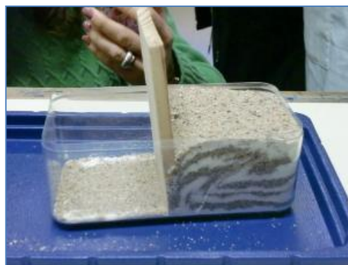
Fig. 2- Himalayas in 30 seconds.