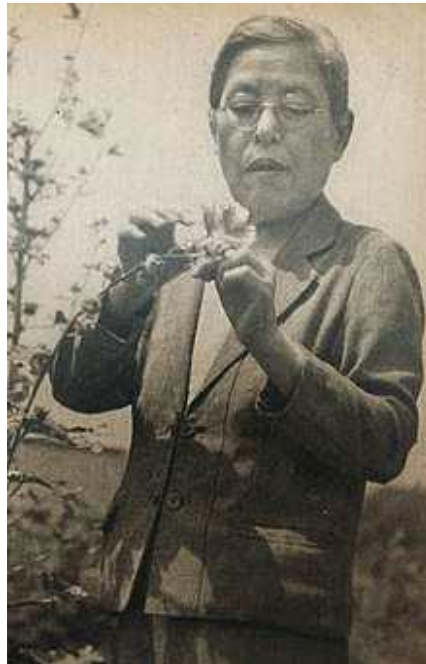
Figure 7. Yasui Kono (1880–1971)

Japanese women had not been permitted to attend school until 1854 and those who wanted to study natural sciences had to become medical doctors and teachers. Then the Japanese government established two additional institutes called Women's Higher Normal School, in Tokyo and in Nara and this is where Kono Yasui began her scientific studies.