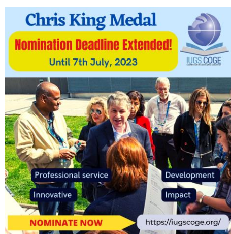
Figure 6: Nominations for Chris King Medal