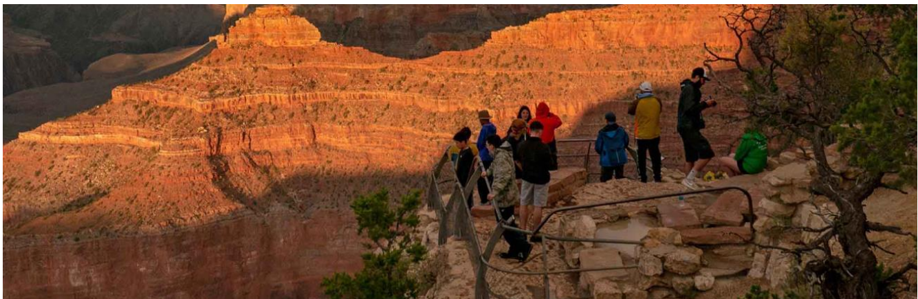
Figure 2. The Grand Canyon, US

https://iugs-geoheritage.org/iugs-adventure/