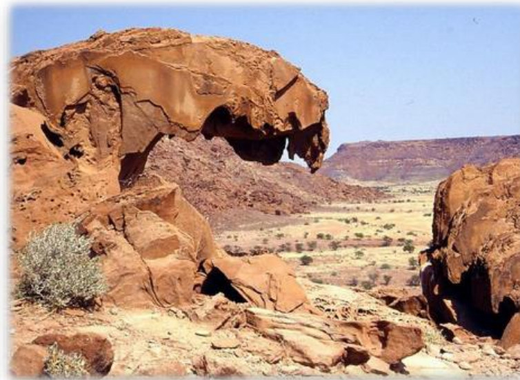
The Lion’s Claw, a distinctive rock formation at the World Heritage site of /Ui-//aes, also known as Twyfelfontein in the Kunene Region, Namibia

“Namibia the World’s Geological Paradise”