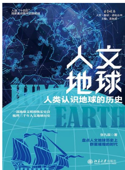
Figure 9. Cover of the award winning book Humanity Earth: The History of Human Understanding of the Earth