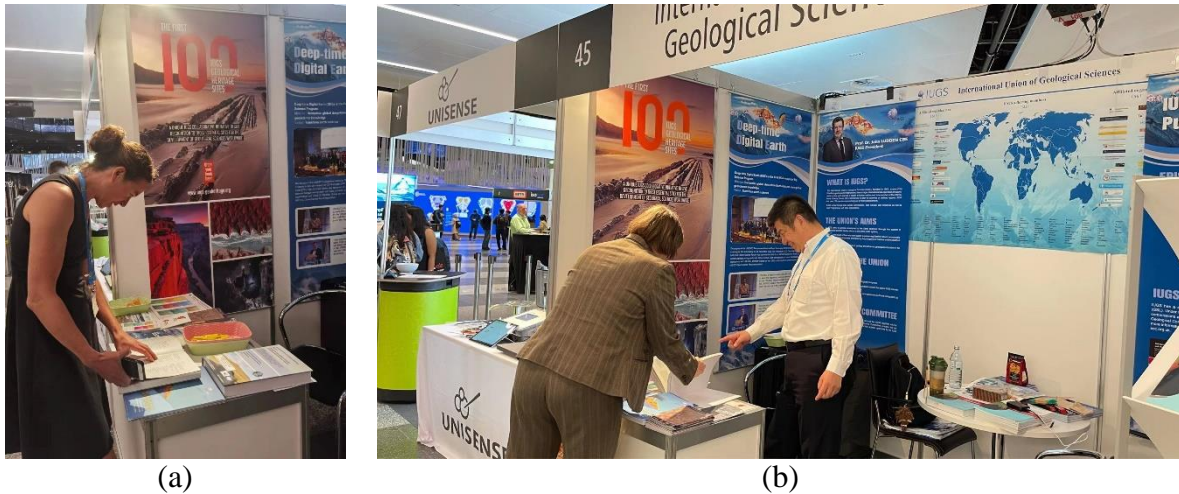
Figure 5. (a) The IUGS Manual of Standard Methods at the inner right-hand side of the front desk, and (b) a conference participant looking at it.