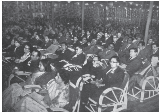
Figure 4. A section of the gathering for the first meeting of the General Assembly.

no less than the distribution and balancing of other features of the morphology of the Earth's crust, was announced in Calcutta in 1852. This formed a fruitful concept for explaining several anomalies in the dynamics of crustal deformation. The discovery of the Gondwana