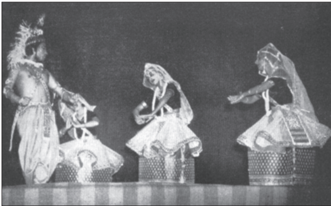
Figure 5. An item from the cultural show.

As usual at meetings of the IGC, a cultural programme was organised by the host country and also what was in 1964 called a Ladies' Programme, but would today be called an Accompanying Members' Programme. A show of Indian dancers delighted the delegates (see Fig. 5).