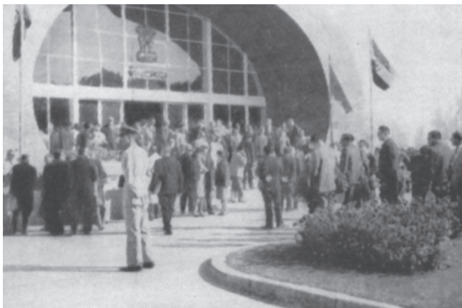
Figure 1. The Congress venue: the Vigyan Bhawan Conference Centre, New Delhi

Out of the more than 800 abstracts received, 415, supported by full papers from 380 scientists, were accepted. Papers were received from 43 countries: India (134), USSR (98), France (25), USA (24), Czechoslovakia (16), Canada (11), West Germany (8), Australia (7), Japan (7), Argentina (6), Brazil (6), East Germany (5), Italy (5), Romania (5), United Kingdom (5), Philippines (4), Poland (4),