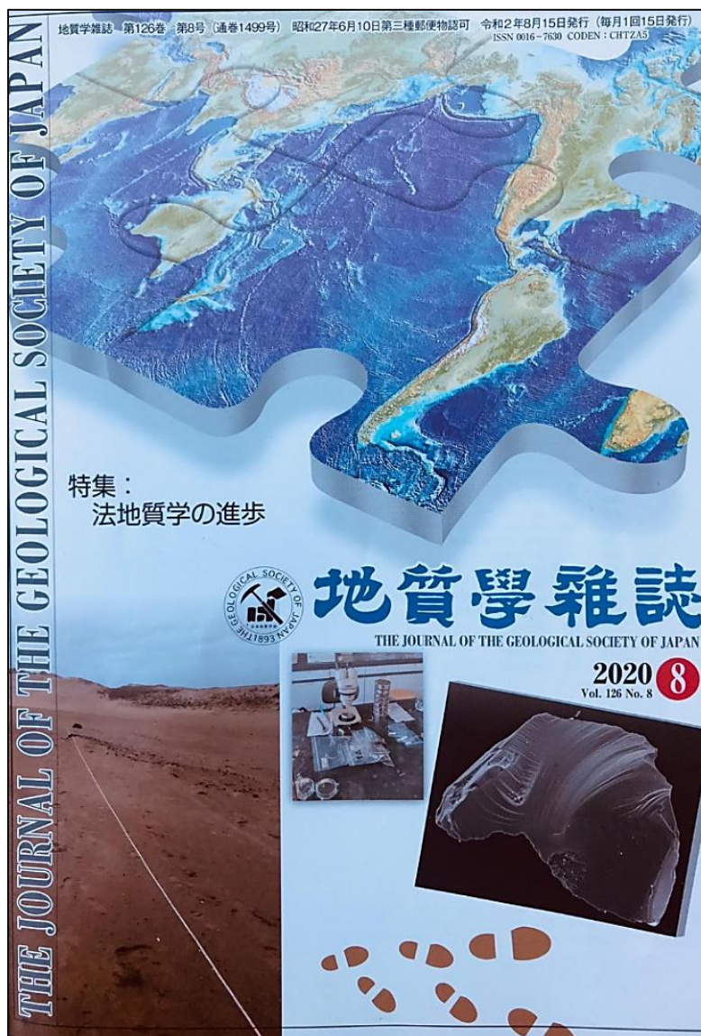
Fig. 2 - The Journal of the Geological Society of Japan, 126(8), 405-470, dedicated to Forensic Geology.

The FGG conference will take place as a virtual meeting on 2 December 2020, in collaboration with the Near Surface Geophysics Group (NSGG). This will include the presentation of the book, 'A Guide to Forensic Geology' (publication pending) and crimes that take place in the minerals, mining and metals industries.