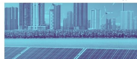
Figure 4. ReSToRE 2

For the IUGS website: A one-page concise text (up to about 500 words), if possible providing a web-link (e.g. to an IUGS activity website).