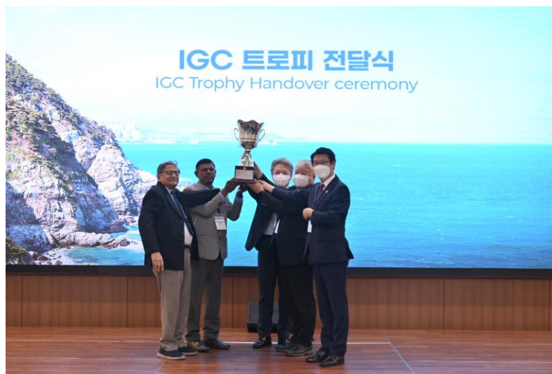
Figure 1. IGC trophy handover ceremony in Busan, South Korea.

The Forum, proposed the certification of the Busan UNESCO Global GeoPark and encouraged the success of IGC 2024; it was conducted as a forum and an on-site visit program for 2 days. Experts who have experiences in participating in the certification of Global GeoPark attended the Forum, providing advices for the certification of the Busan UNESCO Global GeoPark. In addition, the IGC trophy handover ceremony was held during the Forum. The organizing committee of 36th IGC transferred the IGC trophy to the Organizing Committee of Korea, the next host country, announcing the beginning of IGC 2024.