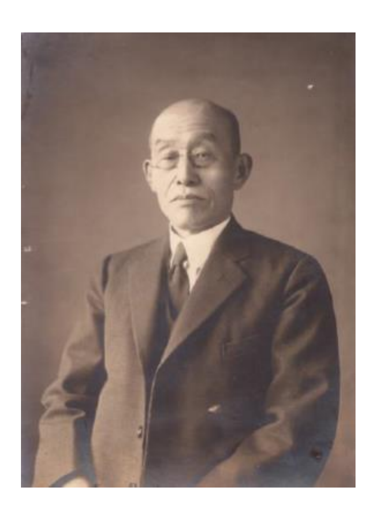
Figure 3. Takuji Ogawa (1870–1941)

http://www.inhigeo.com/anniversaries/INHIGEO_Anniversary_Ogawa.pdf