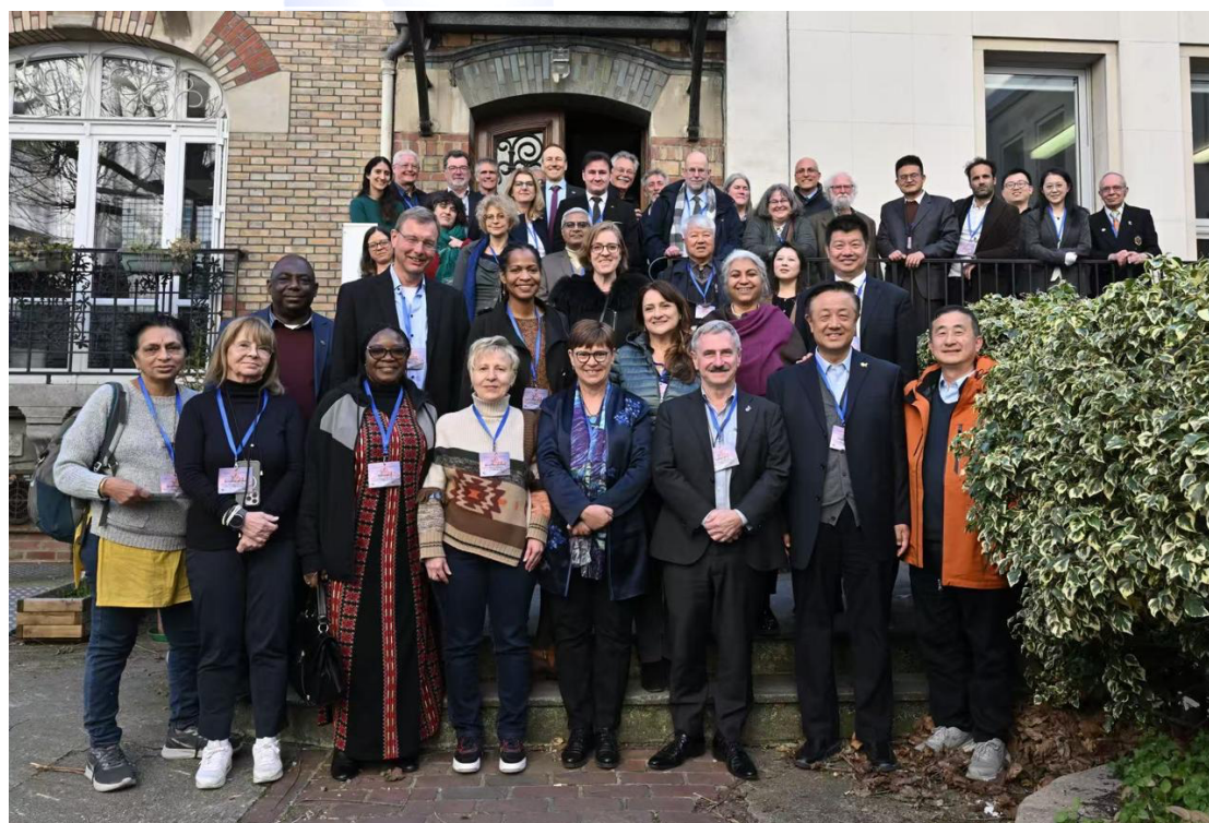
Participants of the 81 st EC Meeting, Paris, March 2025