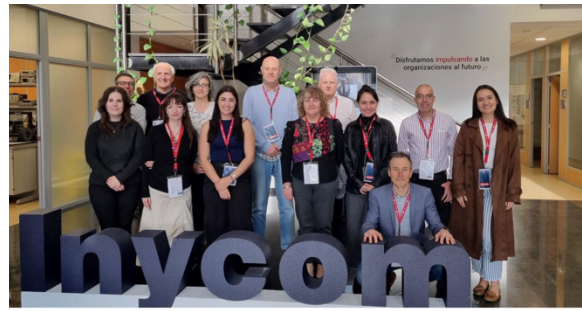
BLOOM General Assembly 4th Nov 2025, Zaragoza, Spain