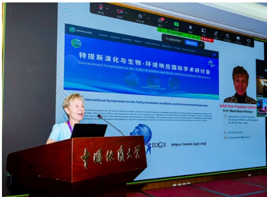
IUGS in Asia (China, Oct. 2025)