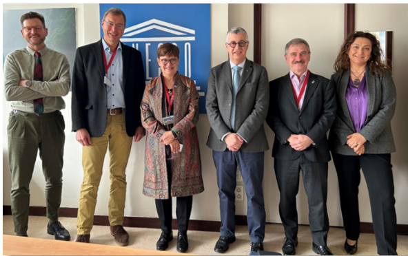
IUGS @UNESCO, March 2025