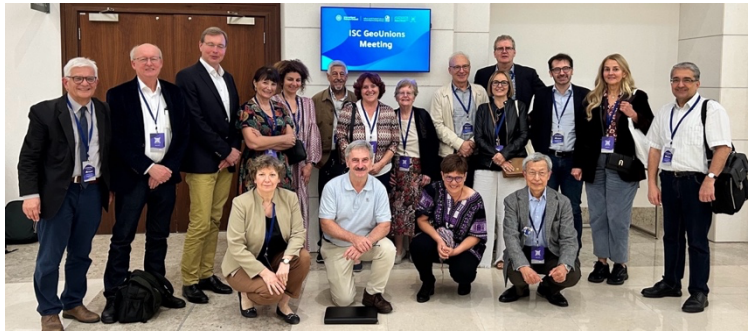
IUGS @ Geo-Unions meeting, Oman, Jan 2025

and CCOP 2 in Laos, the International Symposium on the Tethys Evolution and Biotic and Environmental Responses in Beijing, China, and the 5th IPGC 3 in Spain. The IUGS Secretariat also hosted booths at events such as AGU 4 , CGU 5 , EGU 6 , GEOMIN, and CCOP, which further increased our visibility and engagement with the global geoscience community.