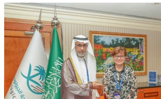
IUGS in Saudi Arabia (Geol. Survey, Oct. 2025)