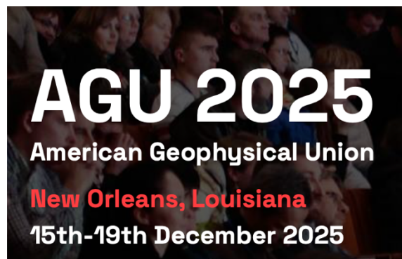
IUGS in the USA, (AGU, Dec. 2025)

In addition to these in-person engagements that other Executive Members and I attended, I had the privilege of delivering virtual keynote speeches at several significant events, including the 2025 Annual Academic Conference of the Geological Society of China, the International Conference on Geological Hazards in Pakistan in Islamabad, the GeoMinE International Conference in Brazil, the Geoscience Education event in Ghana, and the 36th Meeting of the Lithuanian Geological Society.