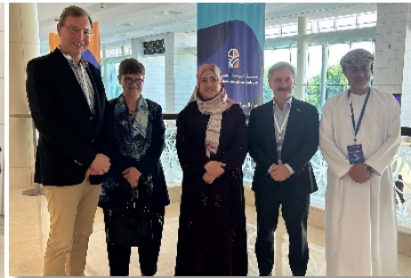
IUGS in Oman with Minister of Higher Education.