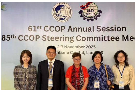
IUGS in SE-Asia (Laos, Nov. 2025)