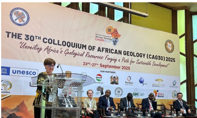
IUGS in Africa (CAG30, Nairobi, Sept. 2025)