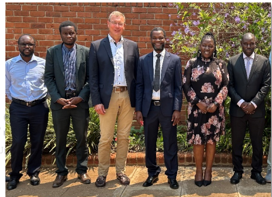
IUGS in Africa (Lilongwe, Malawi, Sep 2025)