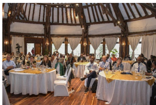
Over 50 participants attended the 3-hours event in person

Later that day, the IUGS and UNESCO co-hosted the special session “United in Geosciences – New Horizons for IUGS/UNESCO & Africa” to advance the Ten Action Plan for Africa (TAP for Africa). Moderated by Ludwig Stroink, more than 70 participants, including > 50 in person and around 20 online, from 17 African and non-African countries, exchanged insights on priorities, challenges, and future directions to strengthen collaboration with the IUGS.