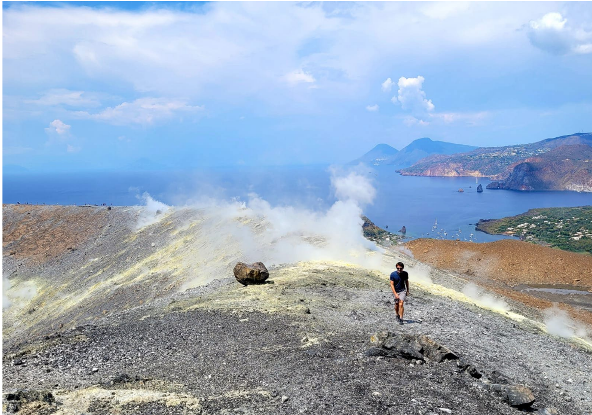
Geodiversity attracts both experts and tourists. The photo shows gases—predominantly water vapour and carbon dioxide, and to a lesser extent sulphur gases—being emitted from fumaroles at the edge of the Volcano crater. Location: Volcano Island in Aeolian Islands in Italy. Photo taken by Marko Komac, September 2021.