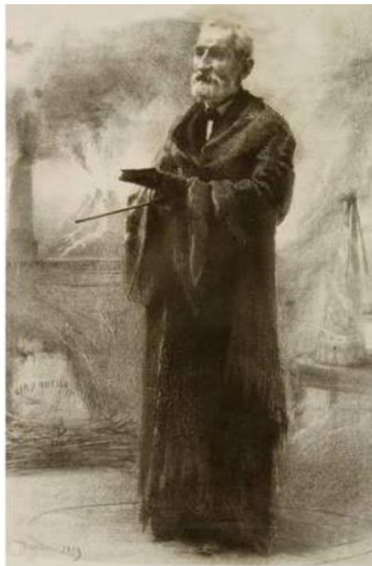
Figure 2. - [left] Paolo Gorini - photograph by G.B. Sciutto, Genoa, 1872 (from Carli, 2009, p. 30); [right] Paolo Gorini, "a man who can play with fire" - charcoal portrait by V. Bignami, 1879 (from Carli, 2005, front cover).