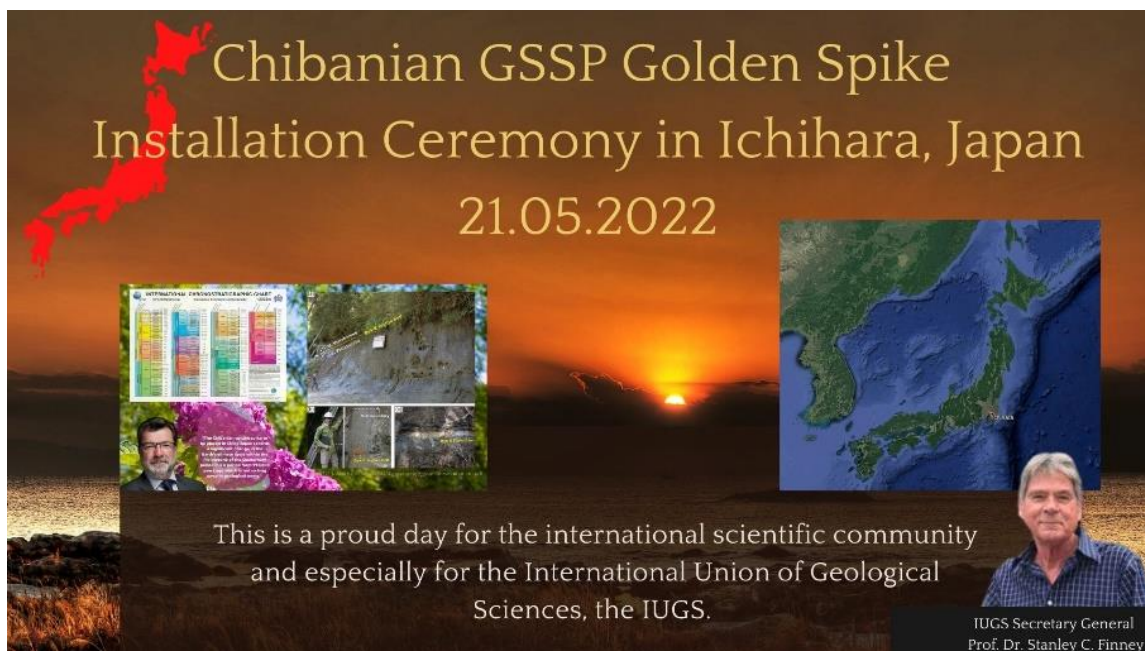
Figure2. Chibanian GSSP Golden Spike Installation Ceremony in Ichihara, Japan.