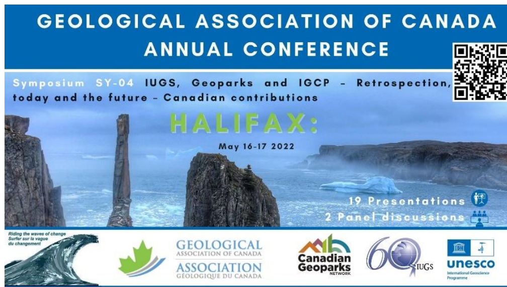
Figure1. Symposium on IUGS, Geoparks and IGCP organized to celebrate IUGS60.

(i). On 16-17 th May, the Geological Association of Canada held its annual conference Halifax. To celebrate the IUGS's 60 th and UNESCO IGCP 50 th anniversaries, the organisers arranged a special symposium with 19 presentations and 2 panel discussions. These highlighted the important contribution Canadian Geoscientists make to the IUGS, IGCP and discussed the importance of Canadian Geoparks, past, present and in the future: https://iugs60.org/gac-symposium-2022/ . The conference was a great success and by all accounts, enjoyed by all who attended.