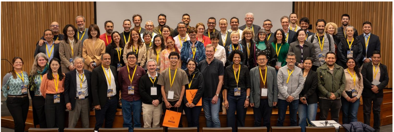
LAC Symposium participants.

The first day featured keynote presentations that provided an overview of the region's geological research landscape and its societal challenges. The second day focused on thematic working groups addressing major topics, including Global Change, Raw Materials and Renewable Energy, Geological Hazards, and Hydrology and Water Management. The discussions generated a rich set of recommendations that will be synthesised into a final document, to be completed soon, which will serve as the foundation for a forthcoming LAC-IGCP call launched by UNESCO.