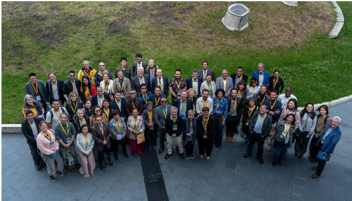
Group photo of the 82 nd IUGS Executive Committee meeting and the Latin American and Caribbean (LAC) Geoscience Symposium at the National University of Colombia.